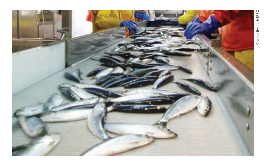
Atlantic herring on a sorting table aboard a NMFS survey vessel.