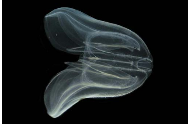
Mnemiopsis leidyi from the Kattegat, Baltic Sea.