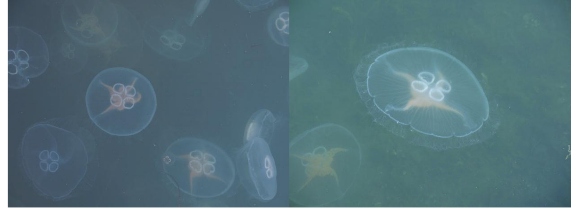
Aurelia aurita from Kiel Fjord, August 2014.