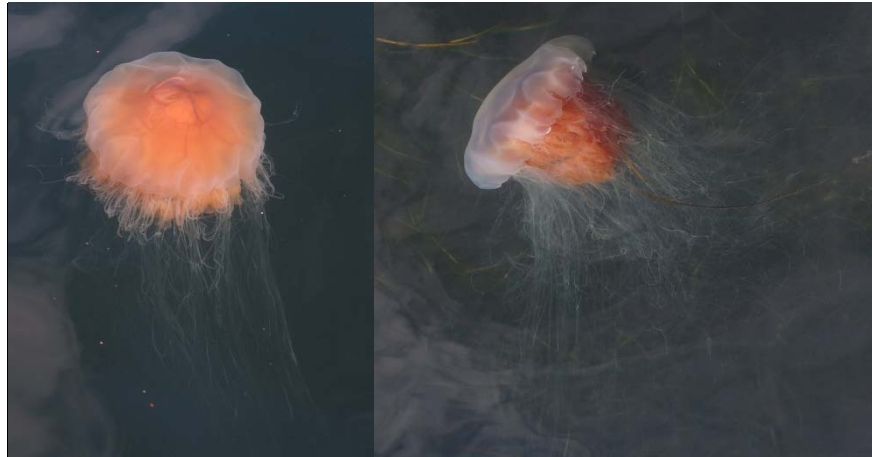
Cyanea capillata from Kiel Fjord, Sept. 2014.