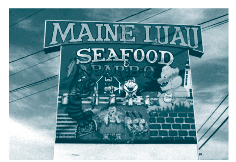
Restaurant sign in Maine, outside Acadia National Park

Commercially-important species and species groups in New England include: quahog clam, cod and haddock, flounders, goosefish, Atlantic herring, lobster, Atlantic mackerel, sea scallops, loligo squid, and bluefin tuna.