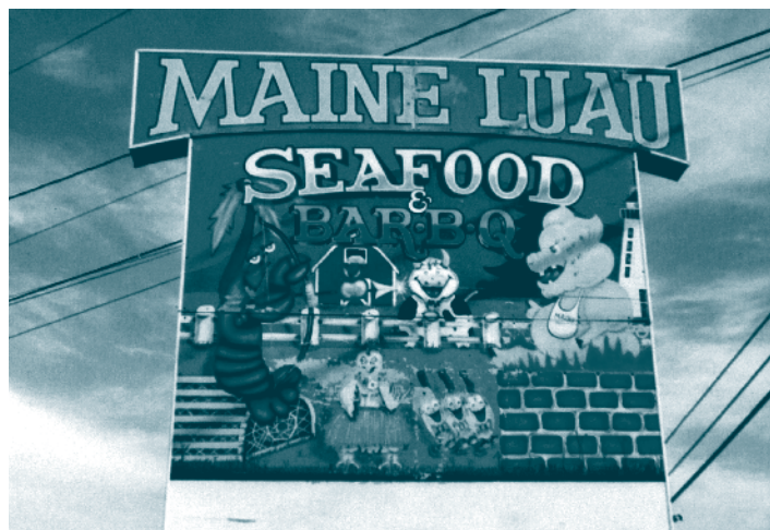
Restaurant sign in Maine, outside Acadia National Park

Commercially-important species and species groups in New England include: quahog clam, cod and haddock, flounders, goosefish, Atlantic herring, lobster, Atlantic mackerel, sea scallops, loligo squid, and bluefin tuna.