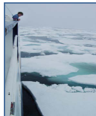
Figure 1: The AFSC's research responsibilities are expanding in Arctic waters.

The AFSC faces the immediate challenge of an expanding mission, both in the types of research required to meet the Nation's needs and in the geographical areas where we carry out our work, and yet we have limited resources to accomplish this research. The Science Plan addresses the desired research activities, infrastructure, and support services for the AFSC over the next 3 - 5 years. The intent is to organize and communicate our research activities in a way that: 1) shows the full suite of research under three main research themes and 12 research foci (Figure 2) so staff can see how their work contributes to AFSC research needs and others can easily understand these needs and 2) identifies the core research activities which would be conducted even under stringent budget scenarios.