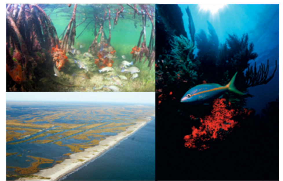
Gray snapper in mangrove habitat, upper left. Coastal Louisiana wetlands, lower left. Yellowtail snapper in a coral reef habitat, right.

The Southeast Region encompasses about 12% (1.34 million km<sup>2</sup> [391,000 nmi<sup>2</sup>]) of the U.S. Exclusive Economic Zone (EEZ). It includes nine inland states (Arkansas, Iowa, Kansas, Kentucky, Missouri, Nebraska, New Mexico, Oklahoma, and Tennessee) and eight coastal states (North Carolina, South Carolina, Georgia, Florida, Alabama, Mississippi, Louisiana, and Texas). It also includes the Commonwealth of Puerto Rico, the Territory of the U.S. Virgin Islands, and Navassa Island (located in the Caribbean Wildlife Refuge).