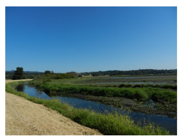
Fisher Slough Levee Removal Project Site

The workshop was divided into several components. Prior to the workshop, the Restoration Center in the Northwest Region led a field trip to several sites in western Washington that have been undergoing habitat restoration to improve habitat function and ecosystem services.