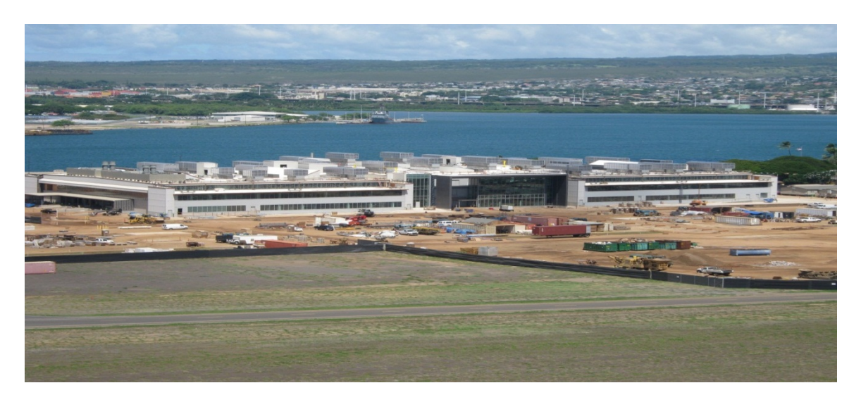
Figure 4.—NOAA Inouye Regional Center at Ford Island under construction.

The NOAA ship Oscar Elton Sette is the primary research vessel supporting PIFSC's extensive field activities. PIFSC staff also conduct benthic habitat mapping and other coral reef ecosystems investigations aboard the NOAA ship Hi'ialakai in partnership with NOAA's National Ocean Service. PIFSC also has about 30 small boats, ranging from 14 to 25 ft. in length, to facilitate near-shore and ship-based research. Both NOAA ships as well as the small boats are based at the Ford Island facility.