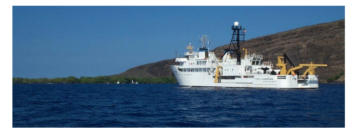
Figure 5.—NOAA Ship Oscar Elton Sette . Figure 4.—NOAA Daniel K. Inouye Regional Center at Ford Island under construction.

The NOAA ship Oscar Elton Sette is the primary research vessel supporting PIFSC's extensive field activities. PIFSC staff also conduct benthic habitat mapping and other coral reef ecosystems investigations aboard the NOAA Ship Hi'ialakai in partnership with NOAA's National Ocean Service. PIFSC also has about 30 small boats, ranging from 14 to 25 ft. in length, to facilitate near-shore and ship-based research. Both NOAA ships as well as the small boats are based at the Ford Island facility.