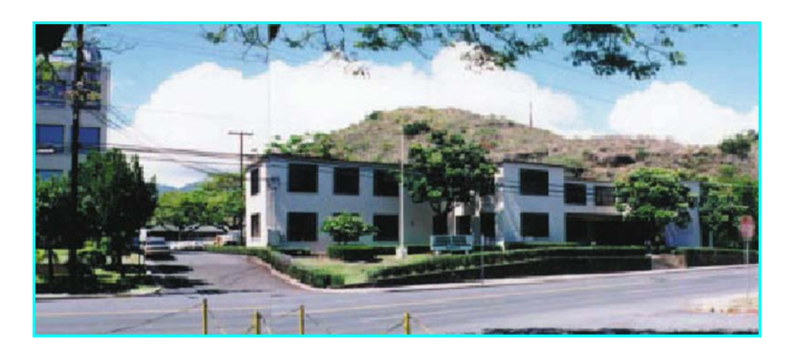
Figure 3.—PIFSC Dole Street facility.

PIFSC is currently located at five sites in Honolulu: the original facility and largest number of staff are located on Dole Street, adjacent to the University of Hawaii's Manoa campus. PIFSC marine mammal, socioeconomics, Western Pacific Fishery Information Network (WPacFIN), and scientific operations programs are located in offices adjoining the NOAA Fisheries regional office on Kapiolani Boulevard in downtown Honolulu. A small seawater research facility was located at Kewalo Basin on the Honolulu waterfront that for over 40 years enabled research on live, large pelagic fishes, monk seals, and sea turtles. This location is now the site of most of the PIFSC corals program. Offices and laboratories supporting fish biology and life history research are leased in Aiea near Pearl Harbor. Several fisheries monitoring staff utilize a joint NOAA Fisheries office at Pier 38 dockside in Honolulu, and a small number of staff are working out of the new but still under construction NOAA consolidated facility on Ford Island (see below).